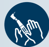
Inspection and maintenance

Designed to give you the best. The best performance in a simple and fast workflow. An innovative thermal disinfectant that replaces the numerous manual tasks typical of the stages preceding sterilization, thus reducing workloads. Equipped with the optional HMD accessory, Tethys H10 extends the reconditioning process to rotating instruments, resulting in unparalleled performance.