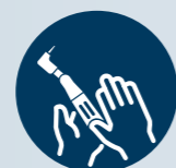
Inspection and maintenance

Designed to give you the best. The best performance in a simple and fast work-flow. An innovative thermal disinfectant that replaces the numerous manual tasks typical of the stages preceding sterilization, thus reducing the workloads. Equipped with the optional HMD accessory, Tethys H10 extends the reconditioning process to rotating instruments, resulting in unparalleled performance.